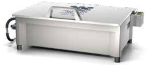
rigid test chamber

Efficient testing: For increased efficiency several cells may be tested simultaneously to achieve high throughput and productivity.